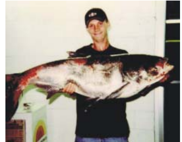
Bighead carp (50 lbs) caught in the Cumberland River, Tennessee in May 2000.

Four species of large Asian carps (grass, bighead, silver and black) have been imported into the U.S. for use in the aquaculture industry, and biologists are raising more and more concerns about their effect on native fish and shellfish when released or escaped to the wild. In fact, in the fall of 1999, fish kills in isolated ditches adjacent to the Upper Mississippi River on the Mark Twain National Wildlife Refuge in southern Illinois included large numbers (97%) of Asian carps, but only one individual each of four native fish species. After that incident, reports came in of commercial fishermen having to abandon fishing sites on the Missouri River because they were catching so many Asian carps that they found it impossible to raise their nets. The common carp, introduced by European immigrants in the 1800's as a food fish, has become so widespread in the U.S. that in most areas it is considered part of the native fauna. The fear is that in time the other four Asian carps will become as widely distributed and abundant, wreaking widespread havoc with native fish and shellfish habitats and foods.