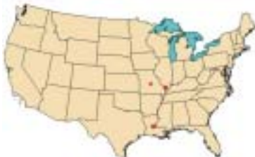
Black carp ( Mylopharyngodon piceus ) ■ Drainages with introductions

altered black carp to fish farmers in the hope that state officials will be more successful than private operators in preventing the escape and spread of this non-native species. Unfortunately, however, black carp have been confirmed in the wild at Horseshoe Lake (2003) near the Upper Mississippi/Ohio river confluence and in the Red River in Louisiana (2004) near the Lower Mississippi/Atchafalaya river confluence.